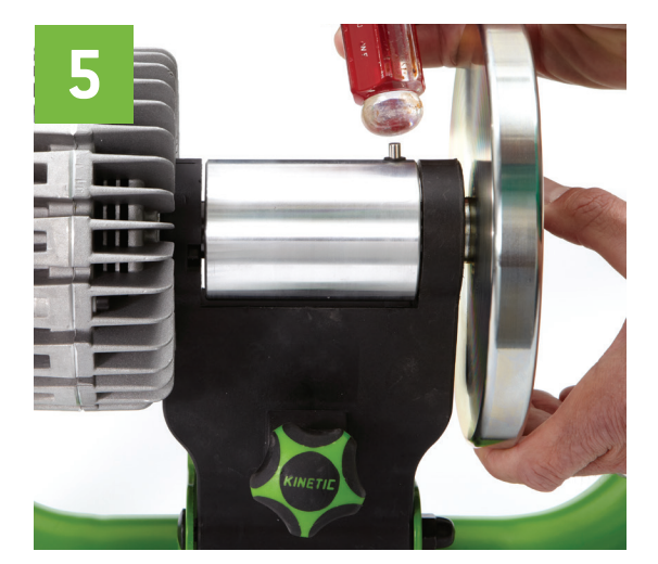
Press magnet flush with grommet using screwdriver