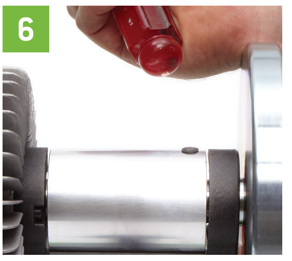
Magnet should be flush with top of grommet