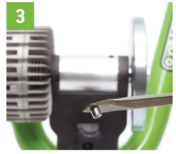
Snap magnet to standard screwdriver to firmly hold