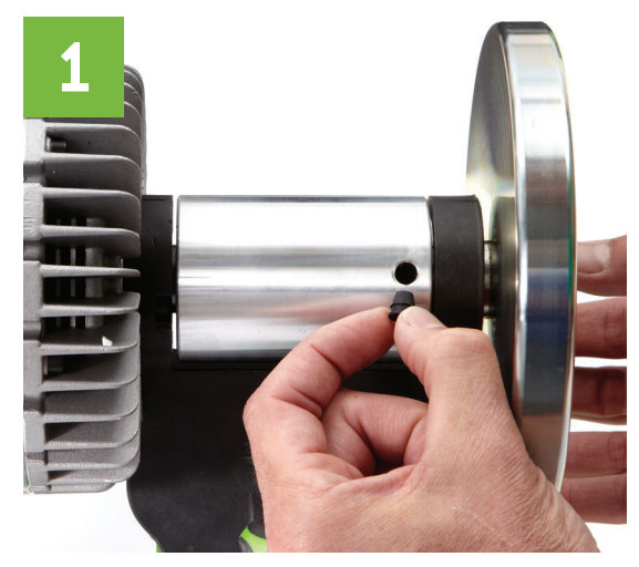
Insert rubber grommet into roller hole